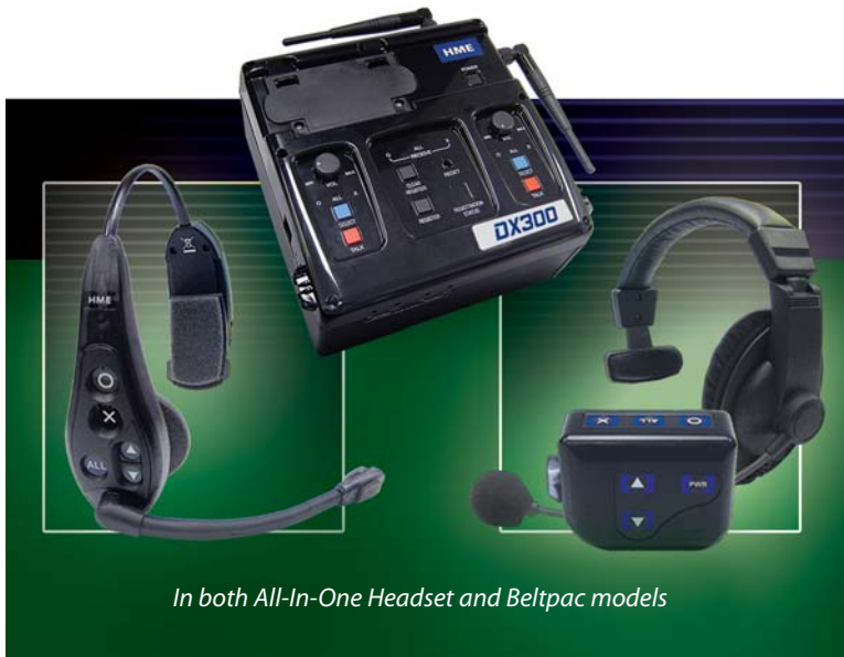
In both All-In-One Headset and Beltpac models

The basic DX300 five-coach system includes five headsets, three beltpacs, a beltpac battery charger, a base station and a carrying case.